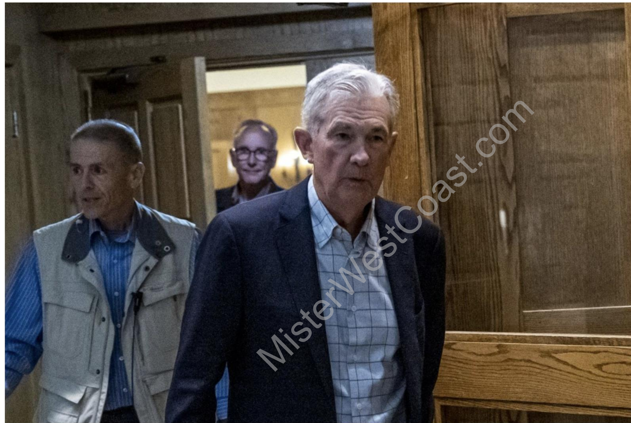
Jerome Powell, chairman of the U.S. Federal Reserve, warns Friday that the inflation fight is far from over in the U.S.

All three major U.S. stock benchmarks booked another week of losses